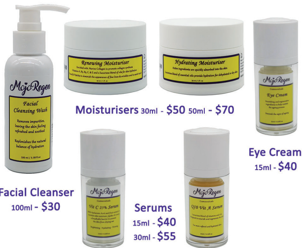
Facial Cleanser 100ml - $30

Cosmeceutical range of creams and serums