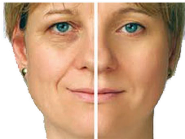
Non-Surgical Facelift result